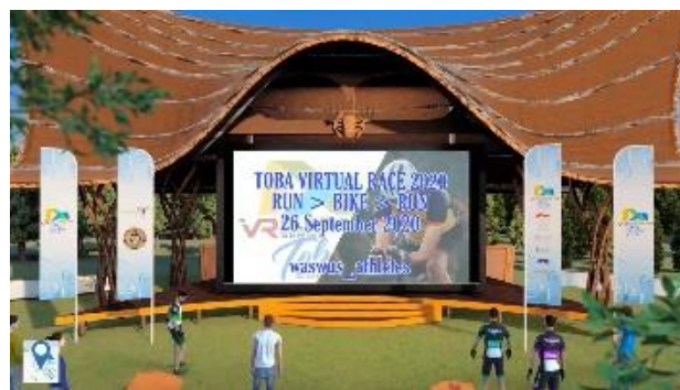
Figure 4. Main stage.