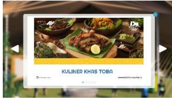
Figure 5. Culinary tourism page. Source: www.triathlonseries.id/vr March 13'2021