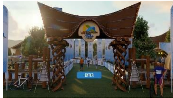
Figure 7. Gate area.

Source: www.triathlonseries.id/vr March 13'2021