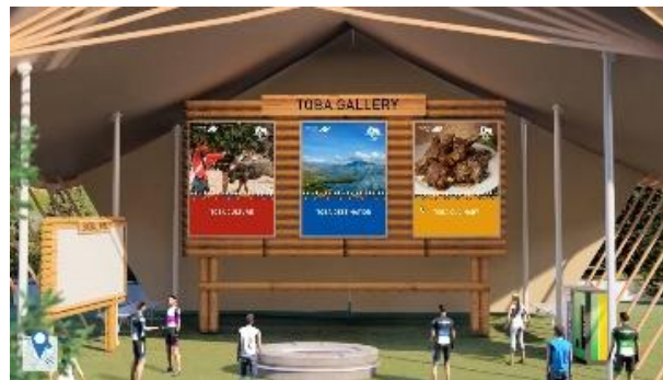
Figure 3. Toba gallery.

In the following question, the display on the Toba gallery, which contains the destinations, culture, and cuisine on the VR, attracts participants to visit these tourist attractions. From the questioner results obtained data that 75% of participants are interested in visiting these tourist attractions. The display in the Toba Gallery seen in figures 3 & 4.