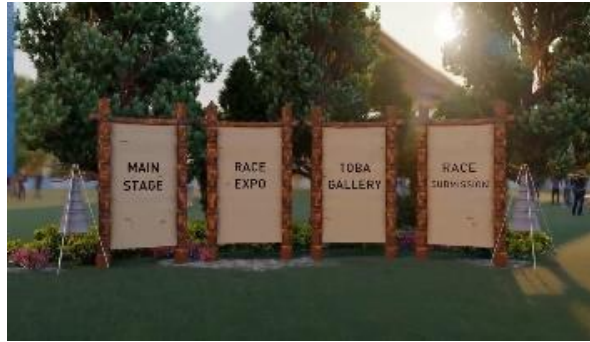
Figure 2. The plaza.