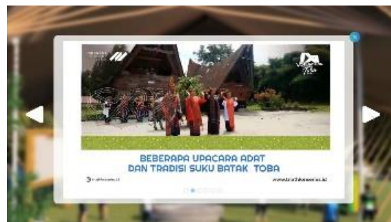
Figure 6. Cultural tourism page

In questions about the decorative appearance of gates and buildings in VR, about 78% of participants stated that the image in VR displays regional culture characteristics. As for the display on the main stage, which provides information, 71% of participants stated that the information given on the main stage was quite clear. The main stage is a location that contains information and explanations about sports events, competitions, and tours from the local area. In the closing question of this questionnaire, about 54% of participants expressed interest in participating in the competition held at this sporting event, and 78% expressed interest in participating in this VR event in the future.