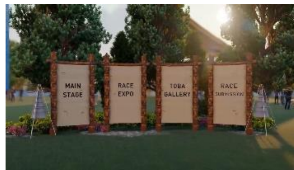
Figure 8. Image caption.

Source: www.triathlonseries.id/vr March 13'2021