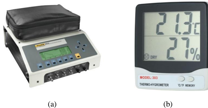
Figure 1. Calibration Measuring Instrument (a) NIBP Analyzer, (b) Thermo-hygrometer

In pre-research stage, the author conducted literature study about state of the art from research on sphygmomanometer calibration. Then, a review of calibration method was carried out. The calibration method used in this study was working method of the Ministry of Health in 2018 [30]. Working method reviewed was studied in detail and reduced into several documents needed during the research. These documents were work instructions, worksheets, and data processing techniques created on google spreadsheets to calculate the value of the measurement uncertainty. Documents which had been made were validated by the quality team of PT NIQ Teknik Indonesia. After did the validation process, the next step was preparation of measurement tools and sphygmomanometer tools to be tested.