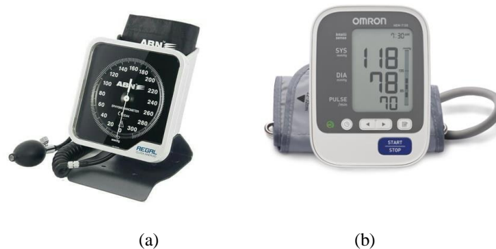
Figure 2. Sphygmomanometer (a) Non Automatic, (b) Automatic