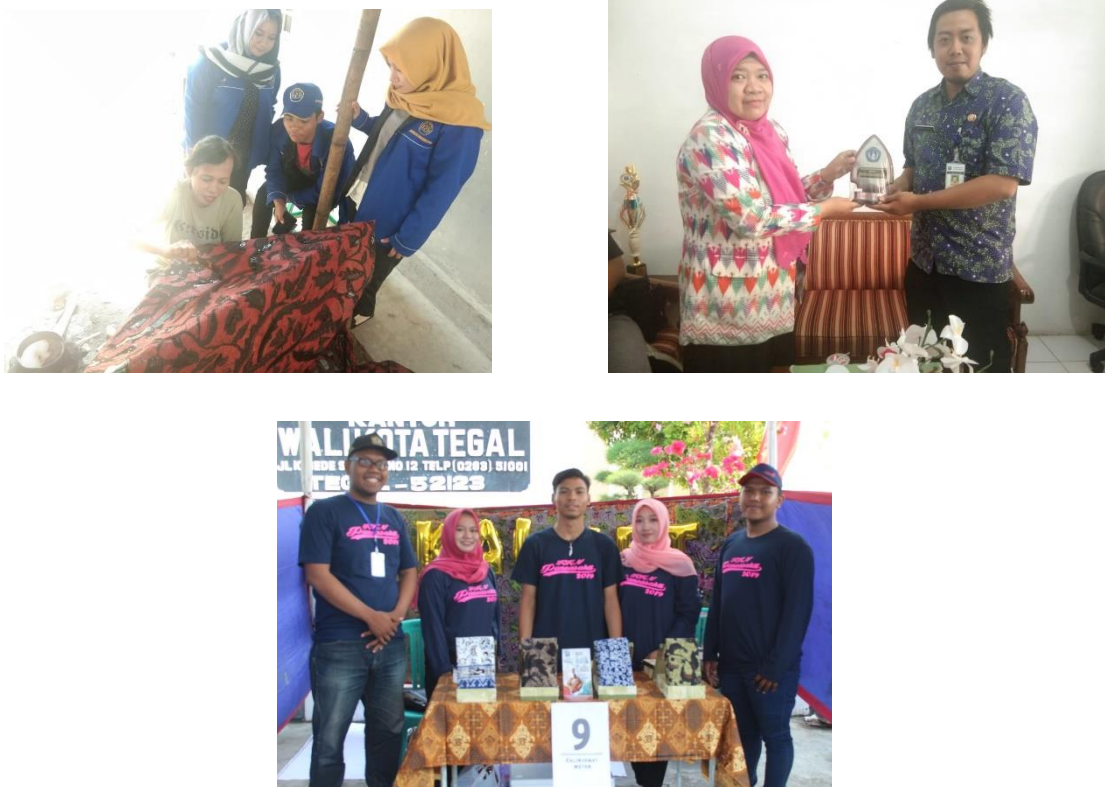
Figure 2. Community partnership program Activities in Kalinyamat Wetan

The evaluation of the program lasts for two weeks. Observations were made on batik packaging innovations that have been made by the community. Whether after a change in product packaging, especially the addition of product descriptions in order to have an influence in increasing turnover or sales volume. The result of this activity is that the PKM team has not been able to measure the increase in sales turnover of residents or trainees due to limited time of activities.