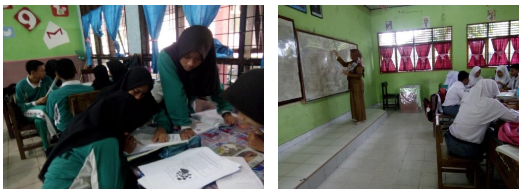
Figure 1: Photograph of research activities using the GI-TEQ model

This research was conducted using the control class and experimental class. Before conducting research prepare learning tools to be used. Learning tools such as the Syllabus, Learning Implementation Plan (RPP) and Student Worksheets (LKS) are validated in advance by supervisors, examiners and subject teachers in schools. In line with the opinion of Yenita et al (2017), Miftahul et al. (2019) that validation was carried out by three validator experts and was revised based on input from the validator. The questions used for the Prettest and Posttest Questions are validated by testing test questions on classes that have studied the Circulation System material.