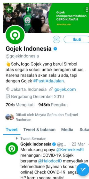
Picture 5. Gojek's Twitter Account

The management of social media is also carried out by PT Gojek Indonesia as a direct marketing tool such as Instagram, Twitter, Google Adwords, and Facebook Fanpage. All of these variables play an important role in shaping the Gojek brand. Sales promotion (sales promotion) is also done as an effort to improve consumers such as Promotional Codes (Promotion Code) which are intended for new users of the Gojek application. The code can be used as a payment tool when using the Gojek application. Another form of promotion carried out by PT Gojek's marketing is improving relations with the public by engaging in various large-scale events.