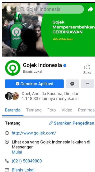
Picture 7. Gojek's Facebook Fanpage Account

Gojek has become a phenomenon in society. Gojek has now become familiar and a part of daily life, especially in urban communities. The Gojek brand has been formed in