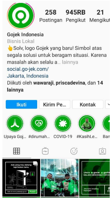
Picture 6. Gojek's Instagram Account