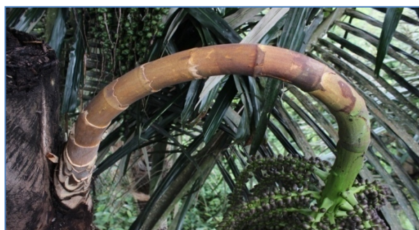
Figure 1. Stalk Necklace

Techniques of Data Collection and Analysis this Research was conducted by survey method by way of exploring and collecting in 2 villages in 4 kecamatan in Kabupaten Tapanuli Selatan. The stages in this research is implemented with three stages. The first stage is the survey sampling was done by purposive sampling is a sampling technique to be sampled based on the criteria there after