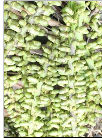
Figure 4. The color of the at an interest jantan the Purple Darkness. Figure 5. The color of the at an interest jantan Hijau Keunguan Figure 6. The color of the at an interest jantan Hijau Young people