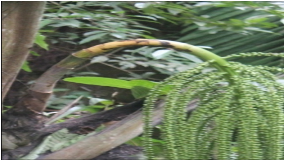
Figure 3. Green stalk with brown color greenish-yellow

which refers to the results of the identifikasi form the stalk. To stalk necklace average color of the stems are greenish-brown (brown color at the base of the stalk and green on the tip of the stalk). But on the green stalk, there are 2 types of the color of the stalk, namely : 1). Greenish-brown and 2). Brown greenish yellow, more details can be seen in figure 3.