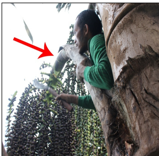
Figure 11. The stalk of the male flower diameter of the most large Figure 12. The stalk of the male flower diameter of most small

The results of the measurement of the diameter of the stalk of the male flower to 40 plant samples at each of the levels of the stalk is diverse. The Diameter of the stalk of 11.4 cm,