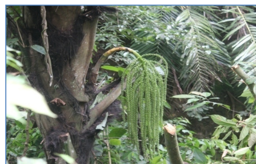
Figure 2. Sprigs Of Green

Obtained 2 forms a stalk of male flowers, according to the Sayaman Siregar (farmers aren village Baringin), commonly named after the stalk necklace and sprigs of green. Both arms, with differences in morphology, stalk necklace shape is more curved and usually longer. The form of the stalk of the necklace can be seen in figure 1 and sprigs of green in figure 2.