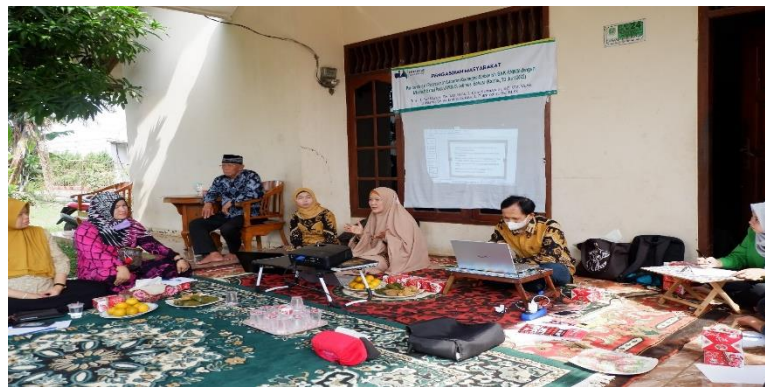
Figure 4. Delivery of material sistem accounting Ms. Excel

In the delivery of the next material regarding the manual book of the Ms. Excel accounting system, this was given for the convenience of MSME actors in using the accounting system. This system is designed simply so that partners can more quickly understand the stem to be applied in their business activities.