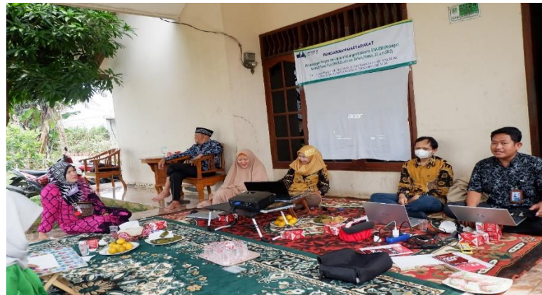
Figure 5. Implementation of the accounting system ms. Excel

The following is a "main menu" display that appears when you first open the Excel accounting system. Inside the main menu consists of several system display menus. The setup menu consists of: company profile data, chart of accounts, supplier data and customer data. Next is the inventory menu; ledger; general journals; lane balance sheet; profit and loss; statements of financial positions; depreciation; taxes; notes on financial statements and information.