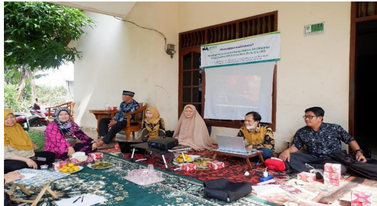
Figure 3. Submission of material on financial statements of SAK EMKM

This mentoring activity was continued by providing material on financial statements based on SAK EMKM, this was done so that before implementing the accounting system partners must gain an understanding of literacy related to the scope of MSMEs and the preparation process financial statements in accordance with applicable standards. Here's an overview of these activities.