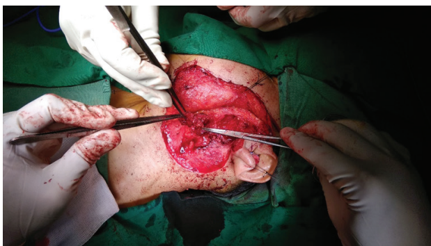
Figure 1. Parotid mass was found during total parotidectomy

therapy for the next three years without any significant complaint. Her first problem was pain in her right upper arm which was assessed as bone metastasis. We referred her to a radiooncologist to be given palliative radiotherapy. She was also given monthly bisphosphonate injection. We switched anastrozole to letrozole due to the progressivity of the disease. A few months later, she started complaining about a painful mass in her left upper neck. Initially, there was no facial asymmetry. We evaluated the mass using ultrasonography and CT-scan. The result showed parotid gland inflammation without any signs of malignancy.