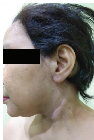
Figure 5. A month after radiotherapy