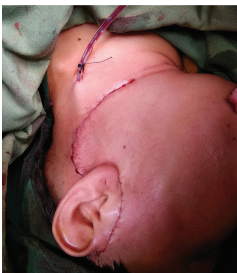
Figure 2. Post total thyroidectomy

We decided to observe the progressivity of the mass while giving her a course of antibiotics. A year after diagnosed with bone metastasis in the humerus, the patient had other metastases to the sacrum and iliac bone. Biphosphonate injection was planned to be given for the next two years. Because the pain persisted after the course of antibiotics, we decided to do fine-needle aspiration biopsy (FNAB). The result indicated the presence of adenocarcinoma suspicious breast cancer metastasis. The tumor board recommended parotidectomy