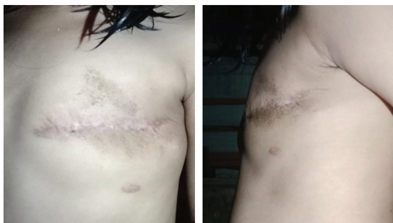
Figure 3. Clinical photos after 7 months follow up