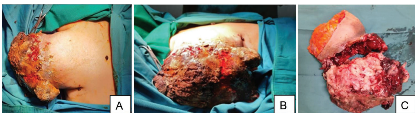
Figure 1. (A) Malignant pre-op condition (R) phyllodes; (B) Malignant phyllodes pre-op (R) conditions; (C) Operative findings of malignant phyllodes

Evaluations in children presenting with a lump in the breast differ substantially from the evaluations in adults because of the marked differences in breast cancer risk and breast architecture. There is little