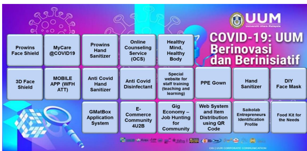
Figure 3. Innovation in UUM during MCO

The urgent demand to respond to some urgent needs due to pandemic has affect the shift the interest in research direction. Researchers were urged to innovate new ideas to improve business and service delivery and providing impactful research outcomes especially to assist affected businesses and entrepreneurs. A quick RM100 thousand (around US$23.5 thousand) in-house research grant was offered for a short term research, all aiming to produce an impactful outcome to ease social tension due to financial insecurity, stress and uncertainty.