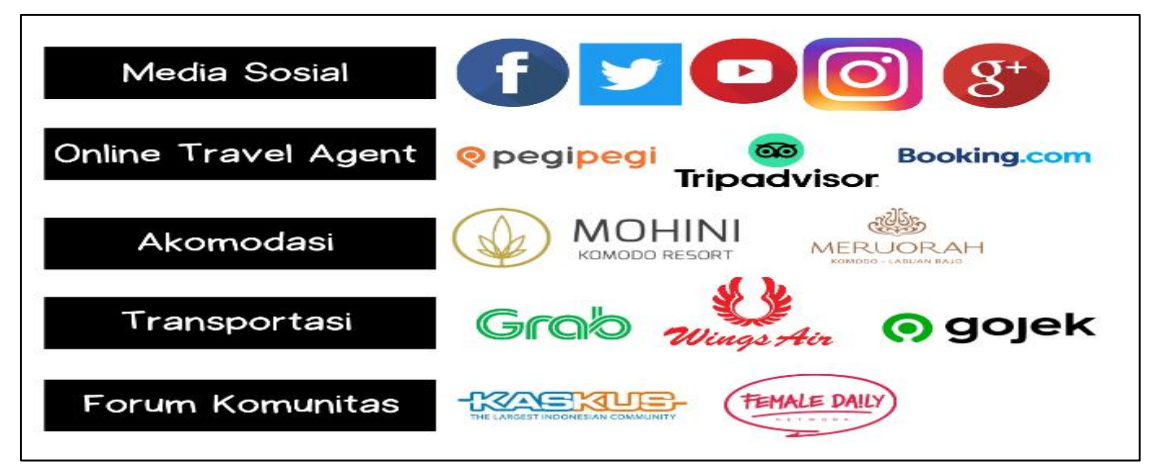
Figure 1. Platform Digital

Various platforms can be used as a means of digital-based marketing (et al., 2020). In Figure 1, several tourism ecosystems are presented, all of which can be accessed online.