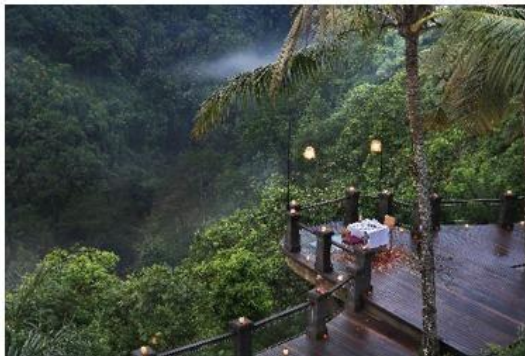
Lembah Ayung Jetty

higher risk of suffering from the negative effects of Covid-19 (Bostan, 2020). Covid-19 is a global disease that causes strict restrictions and closures in many countries in the world. The covid-19 pandemic caused important collapses in many sectors, such as tourism, which is among the sectors that are affected by Covid-19 (Bayat, 2020). The pandemic that has occurred for a year has made it very difficult for tourism to rise. Many hotels in Bali minimize human resources, services, and are even forced to close their hotels, including hotels in the Ubud area. Ubud is an area that has become a favorite list of tourists when visiting Bali. Ubud is also affected by Covid-19 pandemic. The impact of Covid-19 has made hotels that are still operating must have various strategies to promote their hotels, including Pramana Watu Kurung Resort Ubud.