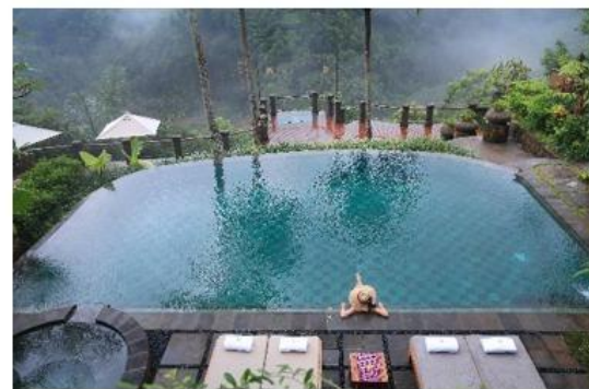
Public Infinity Pool