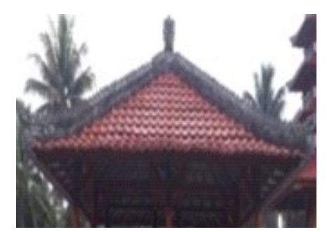
Figure 3. Example of Pelinggih Roof

3. Mr. Made will build a Pelinggih like the picture below on his land measuring 10x10 m.