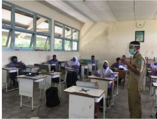
Figure 4. Learning in Cycle I

variable z such as 3x means that there are 3 bicycles, 5y means there are 5 vegetables, and 5z means that there are 5 pencils. The process of algebraic arithmetic operations can be performed if variables are the same. On constants, the researchers explained that constants are only numbers that do not contain any variables. The learning process in cycle I and cycle II can be seen in Figure 4 and Figure 5.