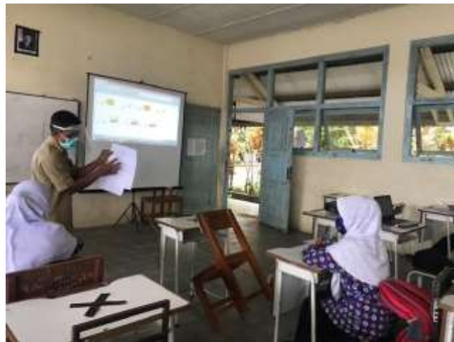
Figure 5. Learning in Cycle II

The contextual approach affected students' understanding in distinguishing variables, coefficients, and constants so that students could complete the test well. Increased understanding of algebraic arithmetic operations from cycle I to cycle II can be seen in students' learning outcomes. Besides, the researchers awarded and praised the active students. Students' activeness in learning can be seen in Figure 6.