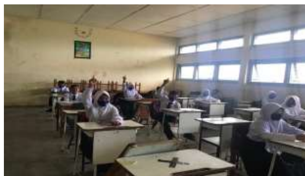
Figure 6. Students' Activeness in Learning

The contextual approach affected students' understanding in distinguishing variables, coefficients, and constants so that students could complete the test well. Increased understanding of algebraic arithmetic operations from cycle I to cycle II can be seen in students' learning outcomes. Besides, the researchers awarded and praised the active students. Students' activeness in learning can be seen in Figure 6.