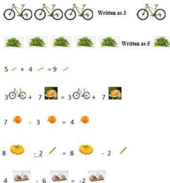
Figure 3. The Application of the Contextual Approach

In cycle II, improvements were made based on the learning process in cycle I. the researchers can manage time better because the materials had been given in cycle I. The contextual approach was emphasized to distinguish variables, coefficients, and constants. An example of the application of the contextual approach can be seen in Figure 3.