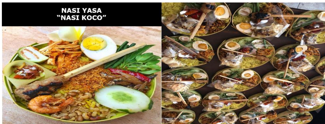
Figure 6. Implementation of the production differentiation strategy in the second year with the product name Nasi Yasa