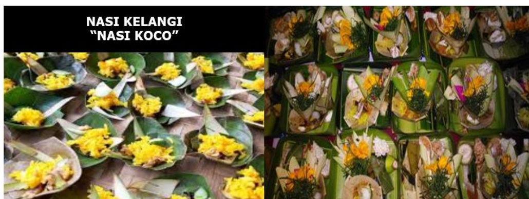
Figure 7. Implementation of the production differentiation strategy in the second year with the product name Nasi Kelangi