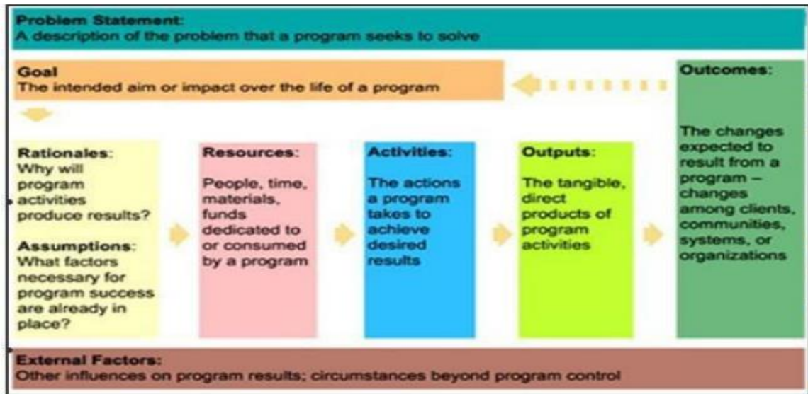
Figure 1. Logical Framework Approach (Collins, 2015)

Nasi Koco community service project, which was started in 2020 and implemented until the time of writing, will be presented and analyzed using a Logical Framework Approach (LFA) refers to the process of analyzing a project using multiple tools, where the Logic Framework Matrix is derived as final analysis product. The matrix serves as a visual representation of project objectives, activities and anticipated outcomes, also provides a structure for defining the project components and activities and how they relate to one another and help to achieve results (Collins, 2015; Gegić, 2018). Following LFA formulation (Figure 1).