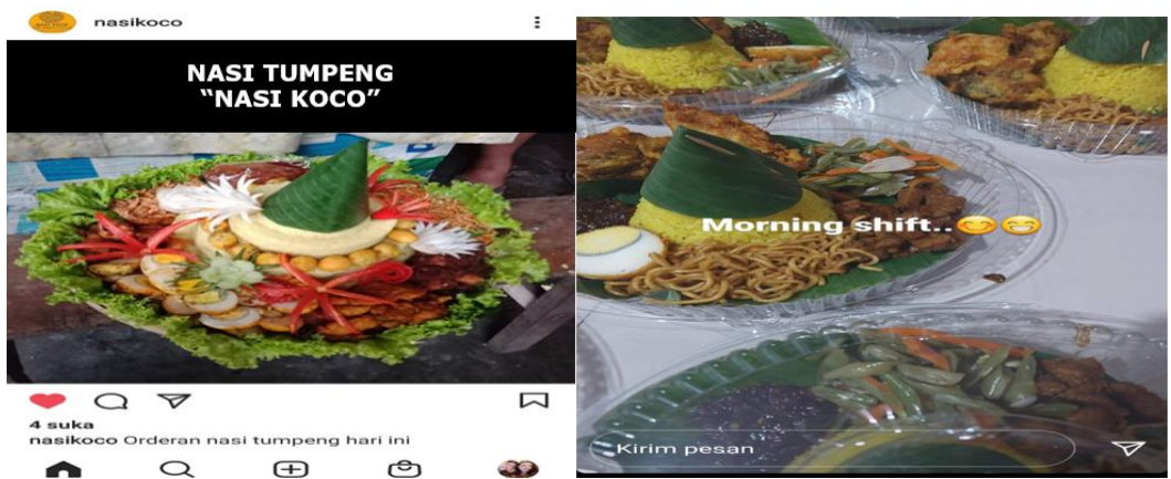
Figure 5. Implementation of the production differentiation strategy in the second year with the product name Nasi Tumpeng