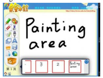
Step 1 Figure 1

The students provide the platform. It's like a Microsoft Draw.