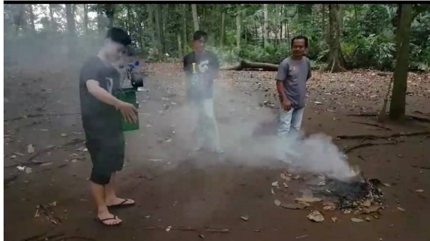
Figure 6. The smoke sensor testing process

When the reading process has been completed by the smoke sensor then the instrument sounds the siren when the siren sound has reached the third sound (Labellapansa et al., 2019), the tool will send an SMS as shown in Figure 7 .