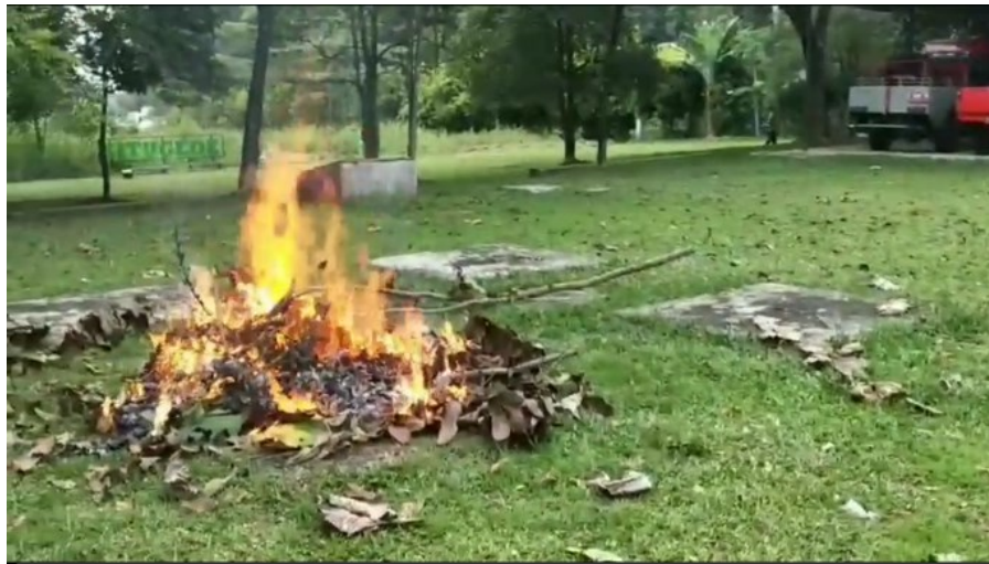
Figure 4. Fire sensor testing process

In Figure 4, it is not visible to the tool that the author has made because the process of taking photos is not comprehensive (Bahrepour et al., 2007), so only visible picture of the indications. When the reading process has been completed by the fire sensor then the siren will sound and when the siren has reached the sound of the three devices will send an SMS as shown in Figure 5. This process occurs when there is a change in voltage on one of the sensors then it is forwarded to the Arduino which then appears an audio and visual warning through a flashing LED and a buzzer that sounds as long as the sensor detects signs of fire (Alqourabah et al., 2021). In addition, the LCD display which originally displayed the status of each sensor will change according to the signs of fire that have previously been categorized (Adjiski et al., 2017), which in the first frame will appear text as shown in Figure 6. In addition, the system also instructs the Arduino GSM Shield to send a notification message, if there are signs of fire to the mobile number that was previously programmed (Kharisma & Setiyansah, 2021).