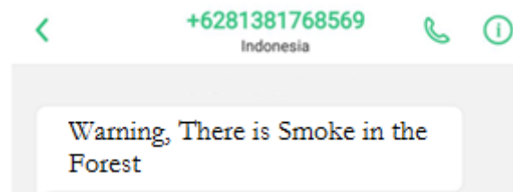
Figure 7. The results of the SMS sending process are indicative of smoke

When the reading process has been completed by the smoke sensor then the instrument sounds the siren when the siren sound has reached the third sound (Labellapansa et al., 2019), the tool will send an SMS as shown in Figure 7 .