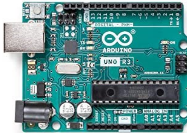
Figure 2. Arduino Uno R3 Specifications