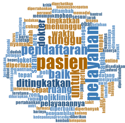
Figure 5. Suggestions and Criticism towards the Outpatient Unit's Services

The collection of excerpts from the answers shows suggestions and criticisms obtained covering all aspects of the service quality dimensions, which are Responsiveness, Assurance, Reliability, Tangibles, dan Empathy. Result from the data processed using NVivo software shows visual below.