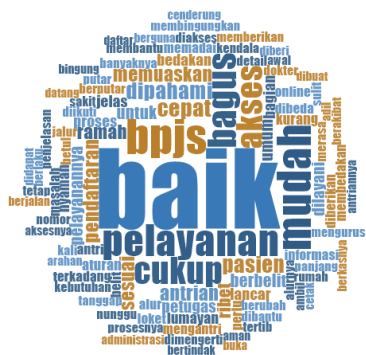
Figure 2. The Thought of BPJS Service Access in Outpatient Department of PSPH

All the entire answers obtained from respondents are then processed using NVivo 12 Plus program into a visual output. The result on the image below shows the words that occurs most often in their essay answers.