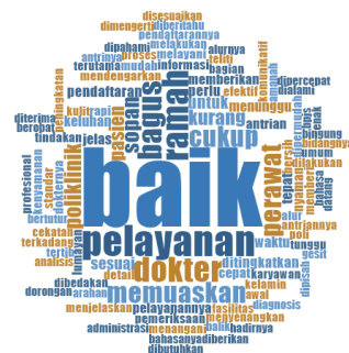
Figure 4. Thought on Overall Service at Outpatient Department in PSPH

Broadly speaking, the quotations from respondents' answers above include aspects of service's speed (Responsiveness), friendly services from healthcare workers (Assurance), a doctor's support that gives encouragement to their patients spiritually to recover (Empathy), criticism about the hospital's online registration system which was not yet well established (Tangibles), and the hospital's infrastructures that could still be improved (Reliability). The conclusions of most of these perceptions can be seen through the visual below.