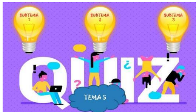
Figure 9. The initial appearance of the subject matter