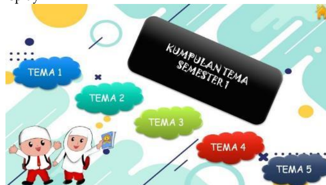
Figure 5 . Material display