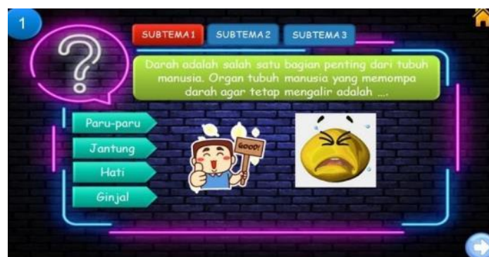
Figure 10. Question display