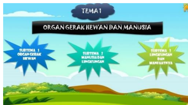
Figure 6. Display sub-theme title