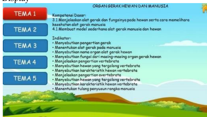
Figure 4 . Display indicators