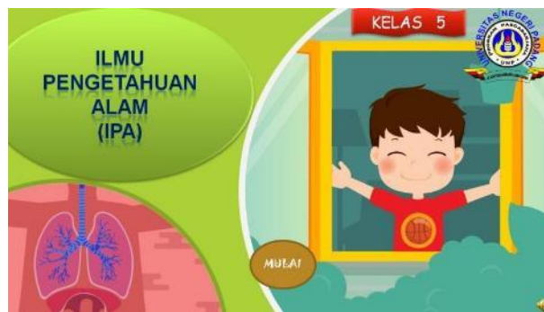
Figure 1. Initial Product Appearance