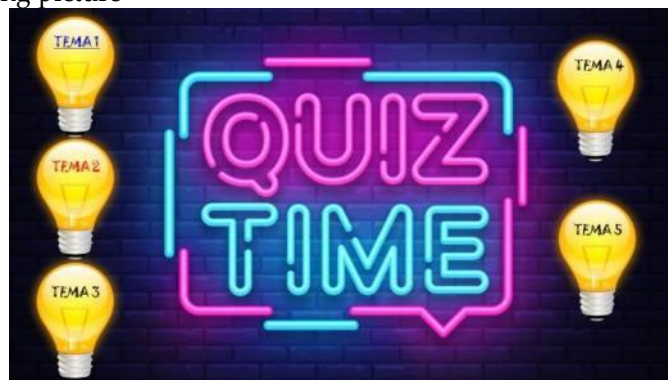
Figure 8. The initial view of the first question

The question display contains the intro display for themes 1, 2, 3, 4, and 5 as shown in the following picture