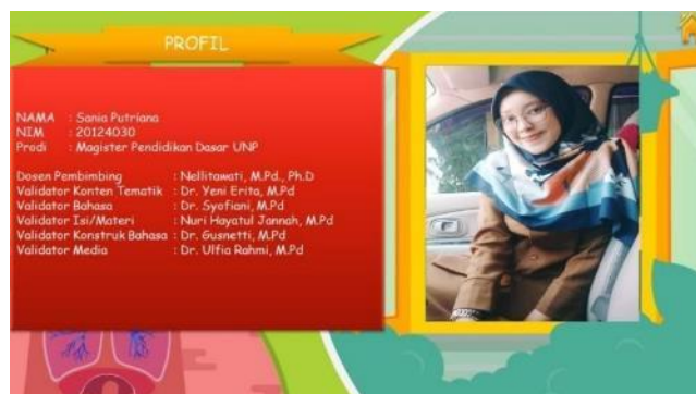
Figure 11 . Profile View