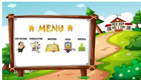
Figure 2. Menu display