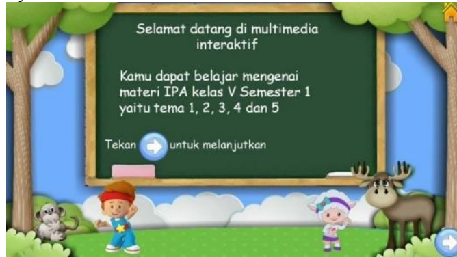
Figure 3 . Hint Display k