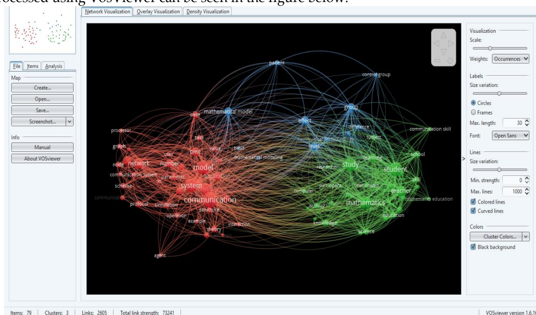
Figure 4. Visualization of Network Topics in Mathematics Communication

Based on the results obtained in table 4 above, the results of the visualization of the 79 topics after being processed using VosViewer can be seen in the figure below: