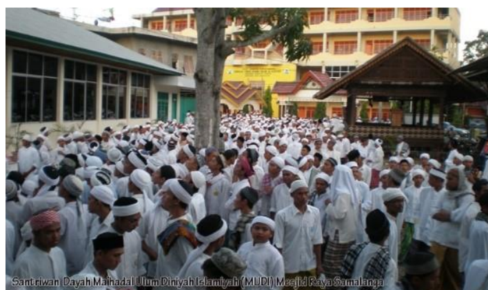
Figure 1. 2 Dayah MUDI Students in Samalanga

The availability of waqf can support the principal and other dayah staff in managing the teaching and learning process, controlling educational activities among students and monitoring dayah regulations towards better student academic achievement, waqf contributions can be obtained indirectly where it can be achieved through the provision of educational facilities. After providing financial assistance from waqf farm property income to teachers and tutors, there is a wide variety of standards found in all dayah visited. Interestingly, according to the speaker of the Headmaster of Dayah MUDI that the availability of waqf plays an important role through subsidies to teachers with income on waqf agricultural resources, although not provided periodically. Through agricultural resource income, teachers are able to increase economic resources and the value of social welfare. The large role of the availability of waqf in three dayah in Aceh is able to fill and develop traditional Islamic education. This proves that the availability of waqf in the three dayah shows the existence of traditional education able to compete with general education. Here is an overview of student activities in Dayah MUDI in Samalanga: