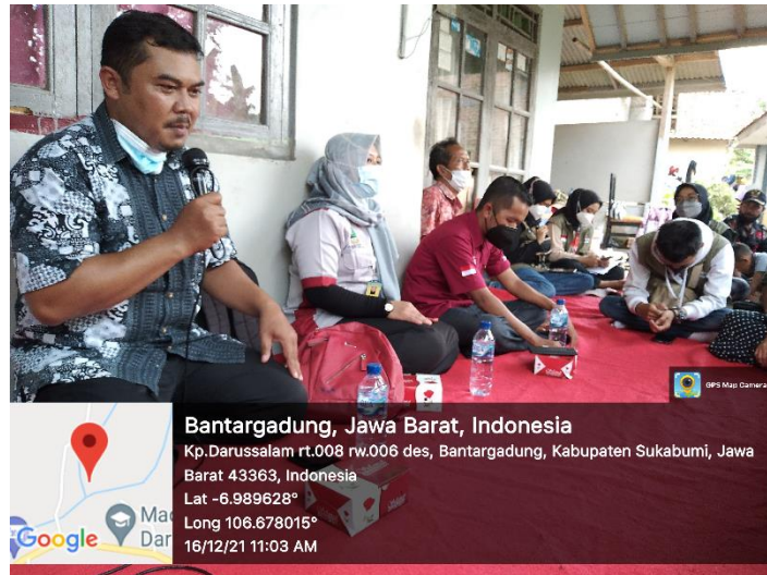
Figure 1. Opening Ceremony