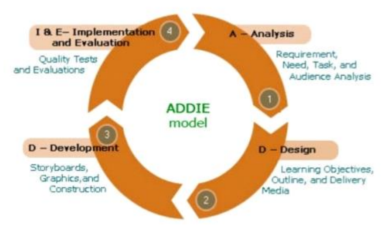
Figure 1. ADDIE learning model design (Muruganantham, 2015)

This study uses a method of research and development based on the ADDIE model. This model is evident in five main stages (analysis, design, development, implementation, and evaluation). Figure 1 shows ADDIE-based learning model.