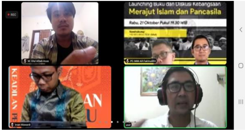
Figure 2: Lauching Buku dan Dikusi Kebangsaan "Merajut Islam dan Pancasila"