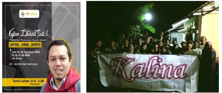
Figure 1: Training of Academic Writing