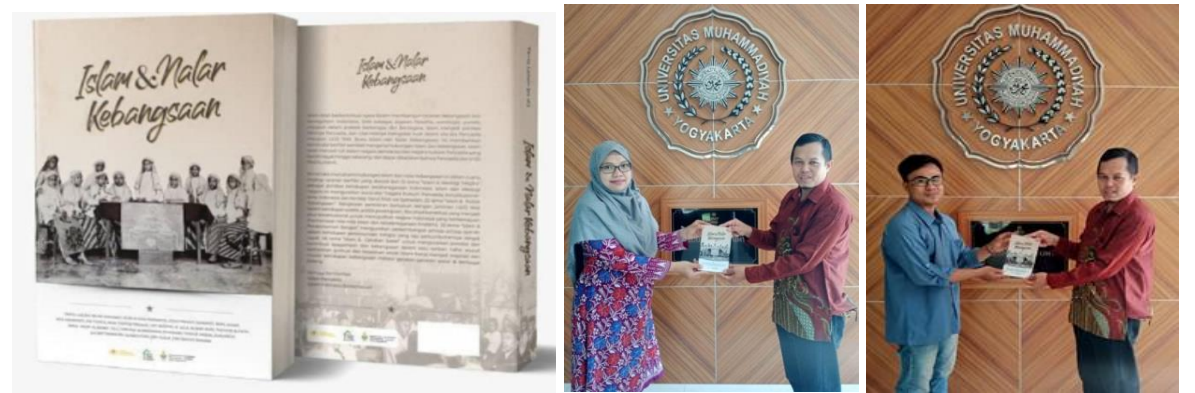
Figure 3. Book of "Islam & Nalar Kebangsaan" and giving a books to PDNA Yogya and IMM AR