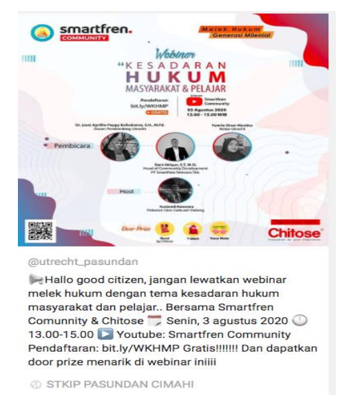
Figure 3. Activities of Students at UKM UTRECHT at the SKIP Regarding Legal Awareness during the Covid-19 Pandemic

In the research context, teaching students about their rights and obligations as good citizens during the Covid-19 pandemic was seen as a strategy to emphasize their role in providing the concept of the state of law through students' campus activity program. In socio-cultural context, technological developments and digital culture cannot be separated one another (Jin, 2017). Therefore, to emphasize the role of the campus, it has provided a student activity unit that can be used as a learning medium for students to understand the concept of the rule of law. The following figure informs the activity that is provided to achieve such a goal.