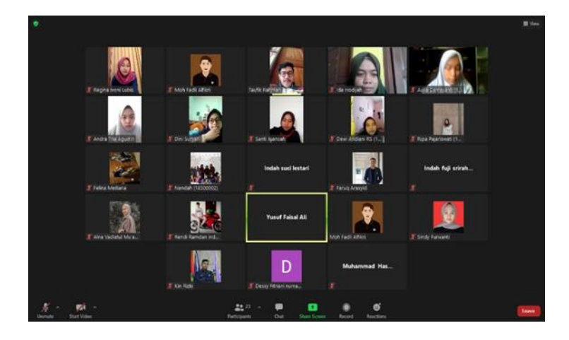
Figure 2. Online Learning through Zoom Meeting