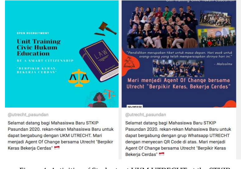
Figure 4. Activities of Students at UKM UTRECHT at the STKIP

Based on the results of the analysis, the optimization of communication technology as a vehicle for education in the concept of the rule of law in the academic community during the Covid-19 pandemic at this STKIP was considered as a way out in facing educational obstacles The concept of a rule of law during the pandemic was to improve the quality of programs during learning process. The benevolence of the rule of law is expected from judicial decision makers to enter administrative, executive decision-making parties, and to advance rule of law projects (Thompson, 2019). In the future, the work environment is recommended to integrate each individual (Broberg, 2000). Therefore, the rule of law education concept at the research setting was to prioritize their professionalism as prospective teachers of Pancasila and Citizenship Education (PPKn) in Indonesia. Integrating the work environment with technology for students at the institute was implemented to realize regular, conducive learning and achieve goals.