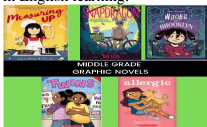
Fig 1. Graphic novels for Middle Grade

The use of literature in the EFL classrooms has advantages in several major fields [10]. Literature is beneficial for language development. It is an excellent resource for accurate speech, a variety of texts, and passionate stories [4]. Literature deals with accurate speech because it is related to real circumstances [11]. The language used in literature is the language of its audience, so it should not be inaccurate [12]. Also, literature deals with different moods and circumstances, so different forms of speech are popular [13]. In fact, speaking and writing by people are different. Therefore, literature has all these different forms of speech using the law [7]. It has its own heat, literature has the value of the text when it is read [3]. Engagement is generally considered an important element of the learning environment, especially in English learning.