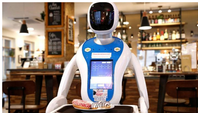
Figure 2. Robot Cafe Waitress

The new desires (maqashid) articulated right here within the framework of technological improvement desires will sooner or later fall into the older type of the 5 Goals to maintain religion, existence, intelligence, wealth and descent. However, those new objectives can also additionally function as a supply of emphasis on positive latent elements of the 5 classical Goals which can be applicable for the context of overdue current technology. Looking at the 5 classical Goals, it is visible that the renovation of existence consists of maintaining the lineage because, without procreation and exact bodily and mental nurture of children, people can not ultimate long. Likewise, renovation of wealth is likewise a need for maintaining human existence. Still, wealth and descent were stated one at a time to set up their importance as a Goal.