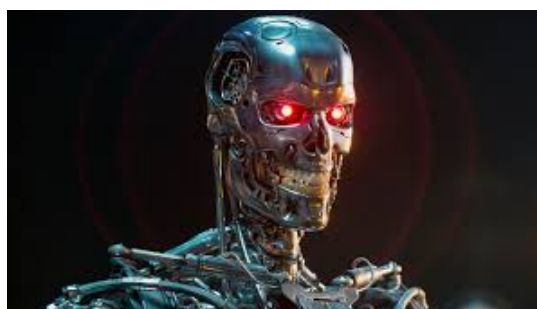
Figure 5. Example of a robot from the film terminator genesis

As previously discussed, the technology that developed is in Surah Thaha verse 98 which contains the content that only Allah is your God who deserves to be worshiped and Allah also knows everything. With that, the human brain will continue to develop in accordance with the contents of the content of Surat Thaha verse 98 which Allah previously knew. AI develops from human thinking that is implemented into a machine or what we usually call a robot. Even in the era of 4.0, scientists are competing to make robots that can carry out activities to simplify human work, such as the example of cafe services that use AI robots. On the other hand, AI technology itself has the positive side of technology for humanity, the positive side is that human work that previously could be done by humans can now also be done by robots [45] . Meanwhile, on the negative side, the increasing unemployment rate has caused the narrowing of jobs which have been replaced by robots. In addition, if these robots can be smarter than humans, it will threaten mankind as in the film "Terminator".