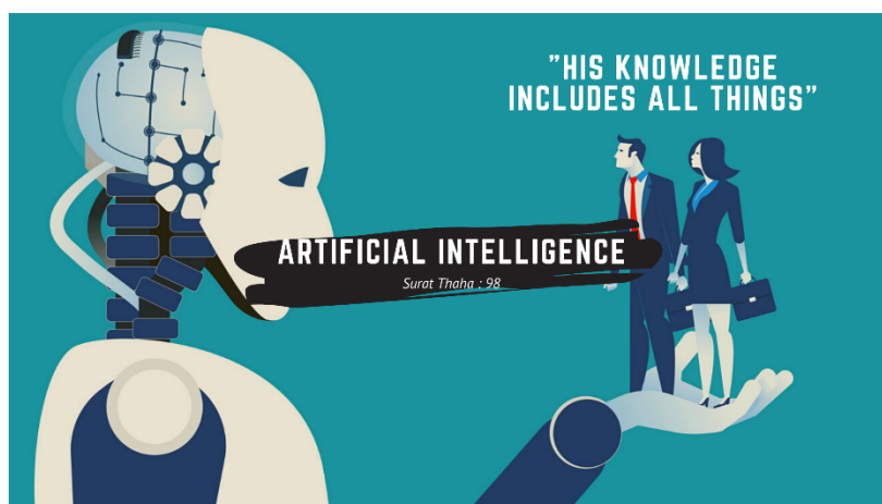
Figure 1. Quotations from the Surahs of the Holy Quran.

Before entering the industrial era 4.0, the Koran has explained the understanding of technological advances in the field of artificial intelligence, previously explained in Surah Thaha verse 98 which means that Allah knows in advance that there will be technological advances with Artificial Intelligence that will replace human activities.