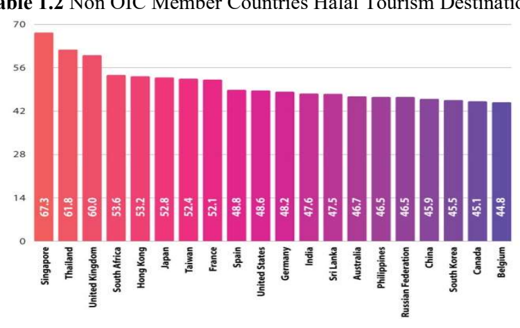
Table 1.2 Non OIC Member Countries Halal Tourism Destination

Among the non-OIC countries, Singapore retained its top position whileother countries have continued to improve their overall ranking (CrescenRating, GMTI Report 2016).