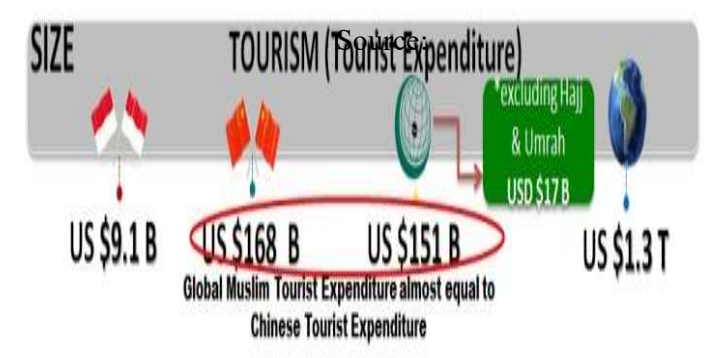
The Accelerated Development Team of Halal Tourism 2017

In general, the potential of halal tourism in Indonesia can be seen from the achievements and target of micro and macro economy compiled by the Acceleration Team and Development Halal Tourism of Indonesia following: