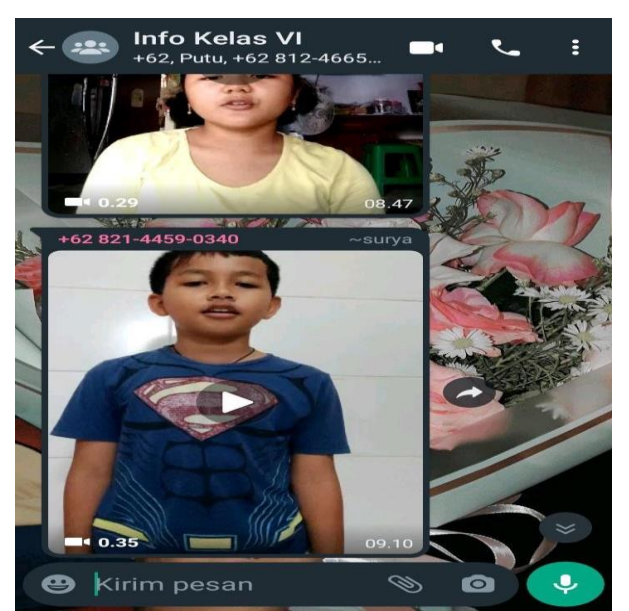
Figure 2. Main Activities

It can be seen that the implementation of song in teaching speaking can be seen in pre-activity when the teacher related the learning theme to the songs (apperception activity) as well in introducing the material by using song by giving the link for the song. The teacher used everyday life song that students are used to listening in which in teaching greeting, the teacher used song from YouTube.