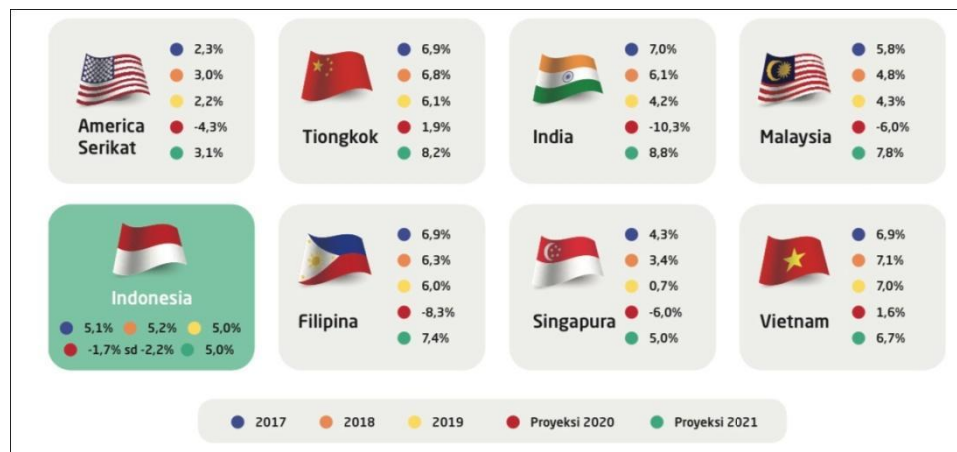
Figure 2. Economic Growth Rate in Certain Countries

World Bank, OECD, and International Monetary Fund (IMF) project state that the slowdown in economic growth in Indonesia is relatively smaller than in countries in Europe, the USA, and Japan. The latest estimation shows that the trading volume declined between 13% and 32% in 2020 (WTO | 2020 Press Releases - Trade Set to Plunge as COVID-19 Pandemic Upends Global Economy - Press/855, n.d.), the global growth fell to -3% (International Monetary Fund, 2020) and various maritime scenarios ranged from a return to the sector average (approximately 3% pa) after 2022 to a declining growth rate of 17% by 2024.