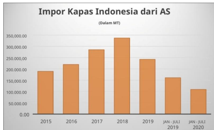
Figure 3. Cotton Data Import From US

In Figure 3, Indonesia has decreased in demand for the textile industry capacity. Indonesia's cotton imports for the January-July 2020 period fell 20 percent to 302,370 tons (equivalent to 1,389 bales). This figure slightly decreased compared to 379,203 tons (equivalent to 1,742 bales) during the same period in 2019. Following a record year for the US cotton exports in 2018, and a moderate decline in 2019 as a result of high residual stocks and sluggish domestic demand, Indonesian cotton imports from the US fell by 32% to 109,081 tonnes (equivalent to 501 bales) from 161,004 tonnes (equivalent to 739 bales) imported during the same period in 2019.