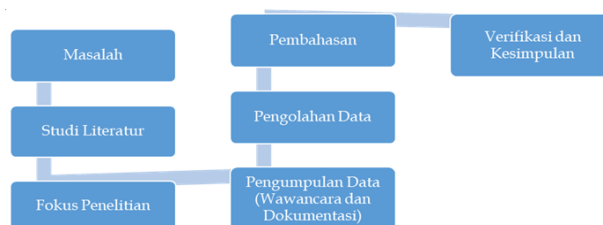
Figure 1. Research Design

This study examined the implementation of the School Literacy Movement (GLS) policy in elementary schools and also the supporting and inhibiting factors of GLS. This study used a qualitative description method with a case study approach as the process of understanding, analyzing, explaining, and testing comprehensively, intensively in detail about something (Suwendra, 2018). The subjects of this study were the principal, teachers, students, and parents of students at SDIT Nurul Yaqin Jakarta. In collecting data, the researchers used semi-structured interviews with the principal, teachers, students, and one of the students’ parents. In addition, data was also obtained from various documentations in the form of photos and learning activities that can be accessed through social media. The data analysis technique referred to the concept of the stages of data collection consisting of data reduction, data presentation, and conclusion or verification. The instrument of qualitative research was the researchers themselves. In the final stage, the researchers tested the validity of the data obtained through the triangulation process by digging up information from students, parents, and teachers at SDIT Nurul Yaqin Jakarta. The research design is shown in the chart below (Hewi and Asnawati, 2021):