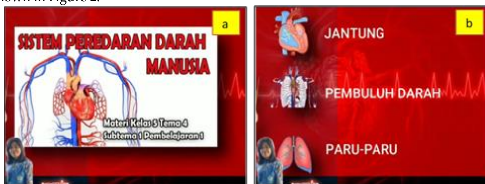
Figure 2 Inshot video, a) The theme of the human circulatory system, b) Circulatory organs

It shows the effect on the class that used the PBMP model. It means that the average value of the experimental class is higher than the control class. The results of the ANCOVA known that the significance level value in the ANCOVA test was 0.000 ( p = <0.05 ), then H_0 was accepted. Therefore, it can be concluded that the hypothesis states that the influence of the PBMP model on student learning outcomes is accepted. The effect of PBMP on the science learning outcomes of circulatory organs in humans is reviewed in terms of differences in learning approaches. The experimental class was taught using the PBMP model. An average of 80 is obtained. Video Inshot on the human circulatory system can be shown in Figure 2.