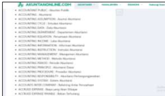
Picture 4.5 Terms in Accounting

e) https://akuntanonline.com/kumpulan-istilah-istilah-dalam-akuntansi/