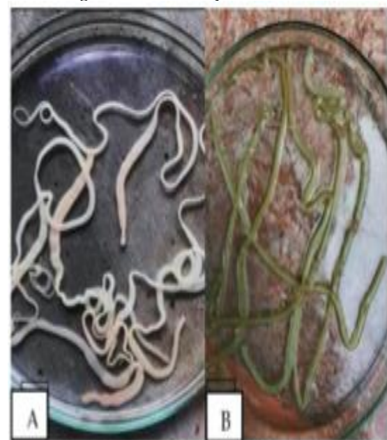
Figure 2. Differences in the characteristics of negative control worms (A) and treatment of pare leaf extract (B).