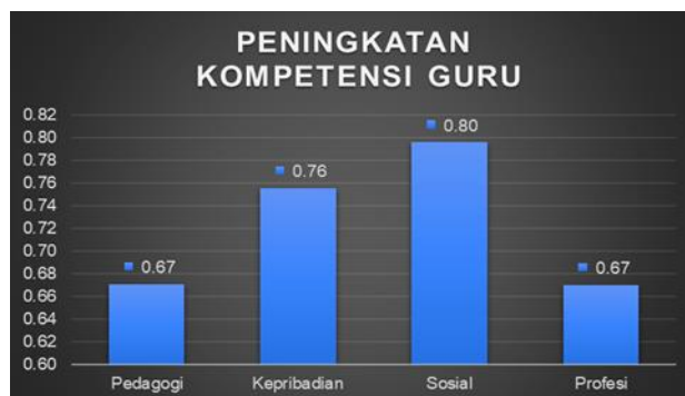
Figure 2. peningkatan kemampuan kopetensi guru peserta pelatihan