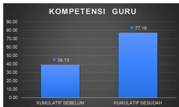
Figure 3. The cumulative ability of participant teacher competencies before and after training

The action taken was that before the workshop participants filled out a questionnaire related to teacher competence, it can be seen in the picture above that the average value obtained was in pedagogic competence 45.05 personality competence 34.59 social competence 45.04 professional competence 31.84. the, after the training activities, the trainees had time to fill out a questionnaire to answer about the increase in the number of trainees after attending the teacher competency training course. And the results obtained after the analysis are that there is a significant increase in the value of pedagogic competence, which can be 72.27, personality competence 78.27, social competence 87.83, and professional competence 70.27. Seminars and educational events have an indirect positive impact through a good communication process by inviting consultants who are experts in their fields. As explained by Rosmawaty (2010), group communication is communication in small groups, both formal and informal, which makes the exchange of information, develop ideas, and solve problems. Formal manuscripts are used when conducting workshops and seminars that will discuss