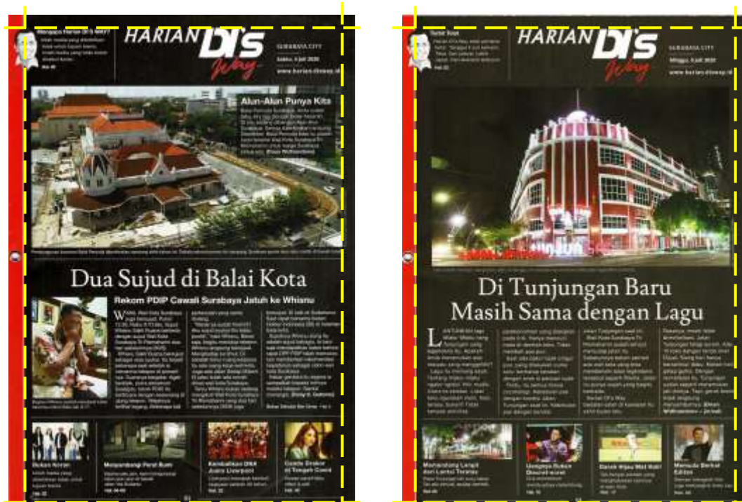
Figure 2. Margin used by DI's Way Daily Cover on 4 and 5 July 2020 (yellow dotted line)

As picture 2 below, you can see the yellow line that surrounds the cover page with a certain size and repeats exactly the same on the two covers of the daily DI's Way. However, for the cover on July 5, 2020, the bottom margin looks like it has been cut off, the contents are very close to the edge of the paper.