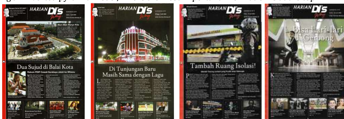
Figure 1. Example of DI's way Daily Cover Design on 4, 5, 22 and 30 July 2020

DI's Way is the latest work initiated by Dahlan Iskan. This print media started from a website where Dahlan Iskan wrote (disway.id). The head office of DI's Way Daily is on Jl. Mayor Mustajab 76, Surabaya. The news from this daily tells a lot about news originating from the City of Heroes. This can be seen from the news in the Main Report section where the general focus is on the situation in Surabaya. This study wants to emphasize the focus of the front page of DI's Way Daily cover design. The designs in the news on this page are the headlines, and spearhead the content of the DI's Way Daily for the day. This research will take information on the DI's Way Daily Cover page in July 2020 which is the month in which this daily was first published. Daily media according to Paxson (2010) has information that is distributed quickly to its readers (p.96). This media has the characteristics of writing news using an inverted pyramid model, where the most important information is at the top.