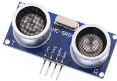
Figure 2. HC-SR04 Ultrasonic Sensor

In ultrasonic sensors, ultrasonic waves are generated by a piezoelectric, which generates ultrasonic waves with a frequency of approximately 40kHz. The ultrasonic sensor works by projecting ultrasonic waves toward a specific area or target. When the wave hits the area's surface, the area reflects the wave back to the sensor, which then calculates the difference between the time of transmitting the wave and the time of receiving the reflected wave [3].