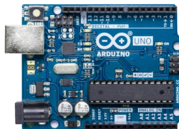
Figure 1. Arduino UNO

The Arduino microcontroller is based on the ATmega 328. Additionally, Arduino can be referred to as a user-friendly open-source electronic platform [8]. Arduino is a microcontroller that is about the size of an ATM card. The Arduino UNO features 14 digital pins, 6 analog pins, a 16 MHz crystal oscillator, a USB connection, a voltage supply connector, an ICSP header, and a reset button [1]. The term Arduino is sometimes used to refer to a programming language or software, namely the Arduino IDE (Integrated Development Environment) [4].