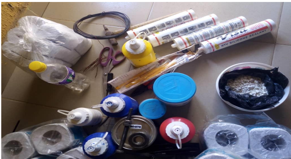
Figure 1. Materials and tools for the production of the 3-dimensional model of human Circulatory system.

Detailed photograph images are shown in Figures 1, 2, 3, 4, 5, 6, 7, 8, 9, 10, and 11.