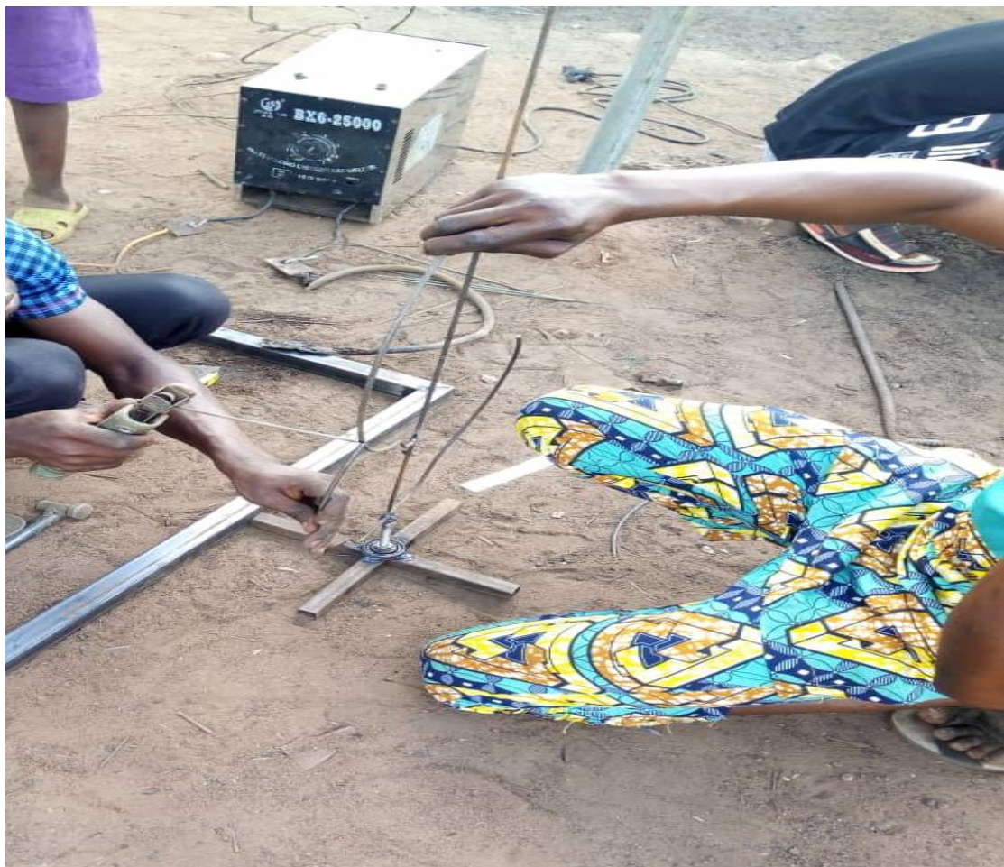
Figure 4. Welding of the armature.