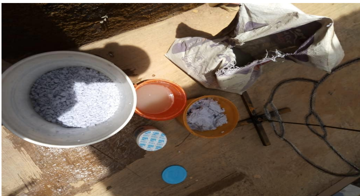
Figure 2. Materials and tools.