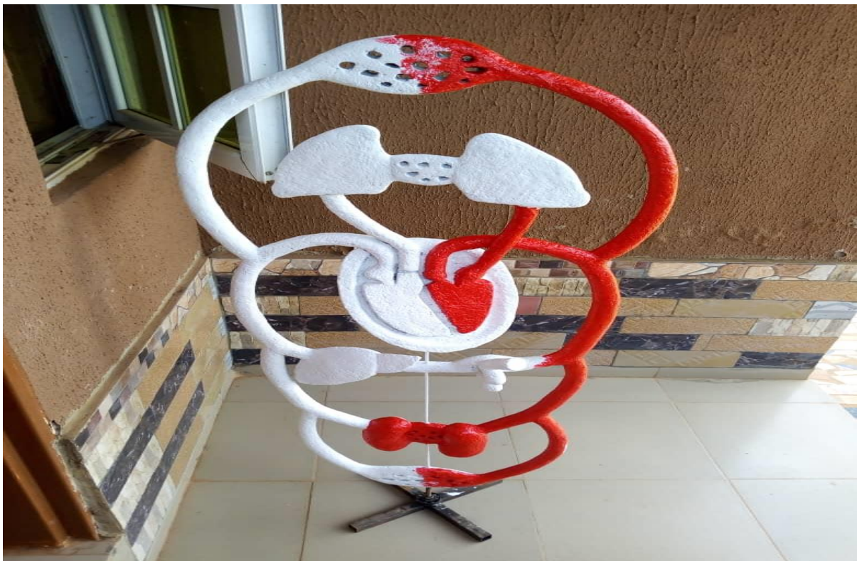
Figure 9. Painting with acrylic in progress.