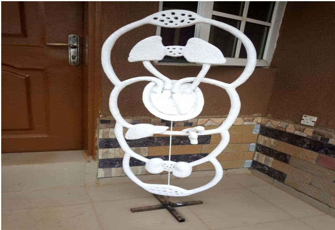
Figure 8. Coating with car paint.