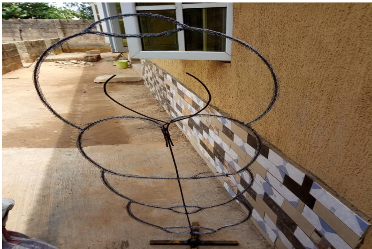
Figure 5. Armature (Reinforcement).