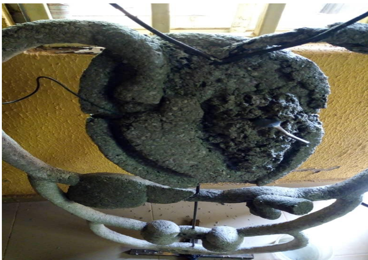
Figure 6. Addictive Stage.