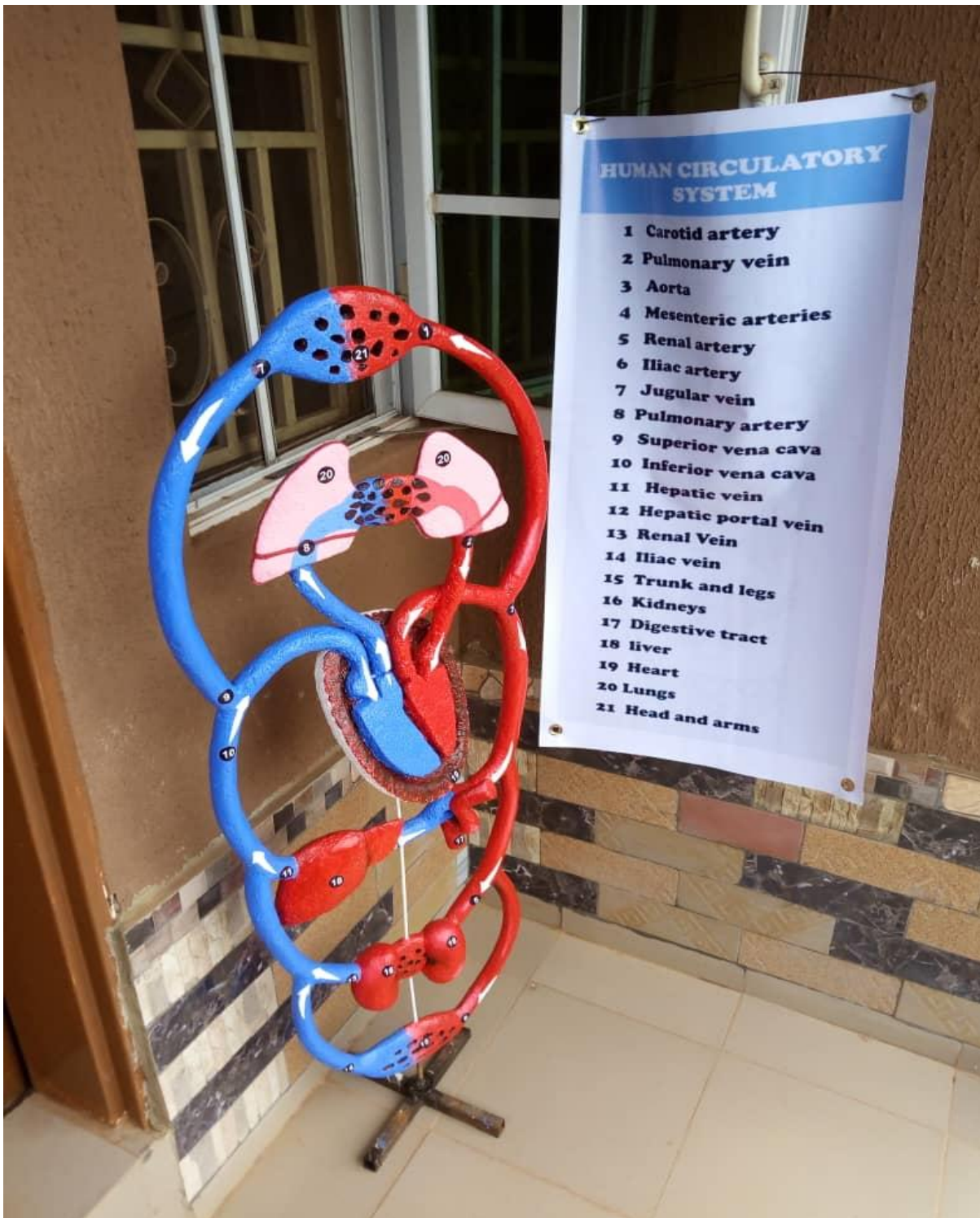
Figure 11. Finishing stage.