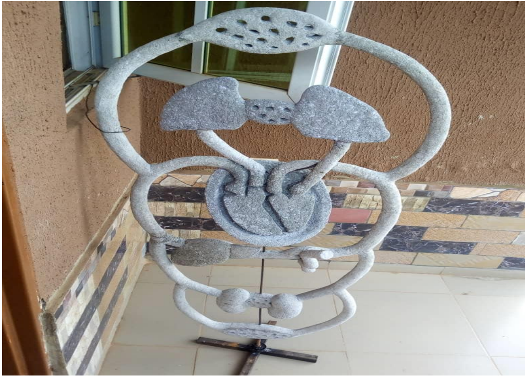
Figure 7. Complete formwork before painting.