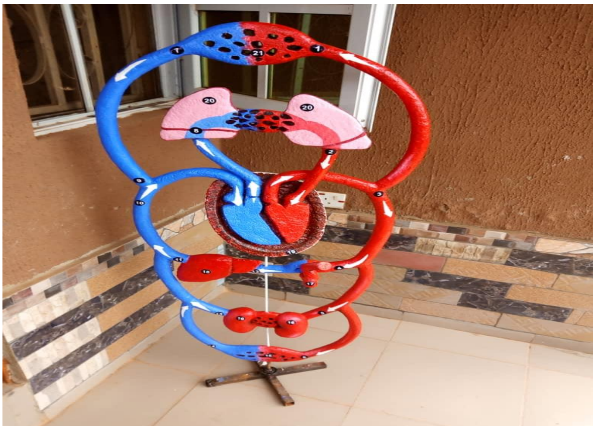
Figure 10. Complete painting with acrylic colour.