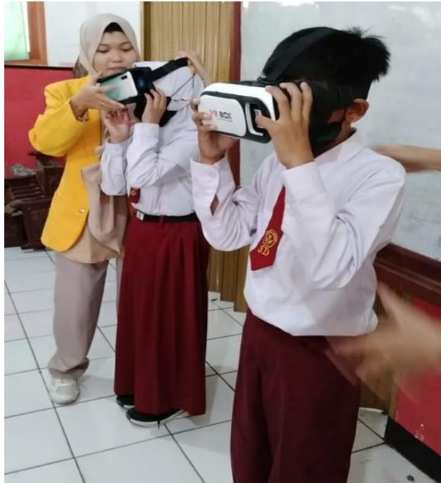
Figure 1. The Sample of Photo of Simulation of Using Technology in the classroom

In every teaching and learning process it should be opened with the initial activities. These activities are carried out by the teacher to create an atmosphere of students' readiness and gathered students' attention to focus on the things to be learned. The activity of opening the lesson is an activity prepare students to enter the core activities (main activities) closing the lesson is activities to solidify or follow up on the topics to be discussed. The component of opening lesson skills consists of attracting students' attention, motivation, giving references through various efforts, and making links or relationships between the materials to be studied. The specific purpose of opening the lesson is the emergence of students' attention and motivation to deal with learning tasks that will be done; students know the limits of the task will be done; students have a clear picture of possible approaches taken in studying parts of the subject matter; students know the relationship between experiences that have been mastered with new things to be learned or unfamiliar; students can relate the facts, skills or concepts listed in an event; and students can find out the level of success in learning the lesson, while the teacher can know the level of success in teaching (Sundari & Muliyawati, 2017).