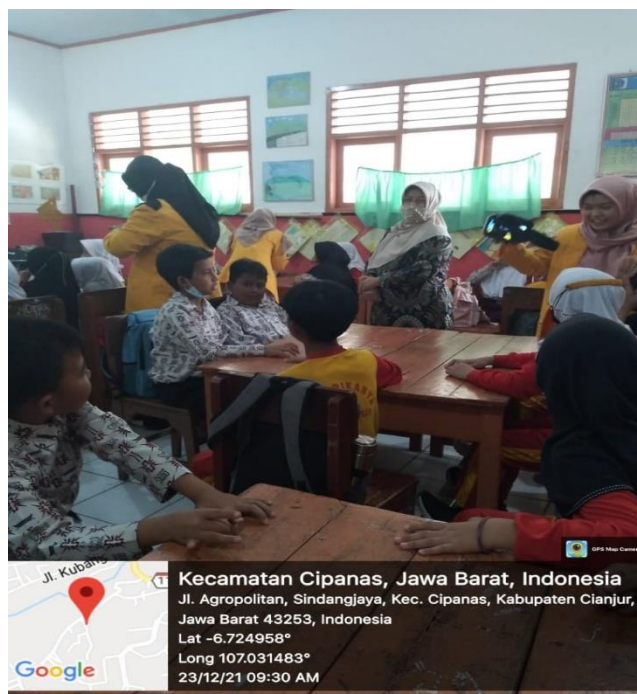
Figure 2. The Sample of Photo the Students Work Collaboratively with their Friends and Teachers