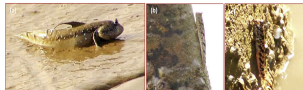
Figure 2. Fish activity B. Boddarti (a) and P. variabilis (b, c) (Wicaksono, et. all. , 2016)

Boleophthalmus boddarti spends his time in the mud and in the aquatic regions (60%). According to Polgar (2012) members of Boleophthalmus live in areas where there is no vegetation, bright areas and no wet mud flow (low intertidal areas). B. boddarti has a habit of lifting dorsal fins (3.26%) when walking, winking, raising and shrinking the operculum (7.82), and making a jumping motion (1.63). The gelodok / Mudskipper has eye (vision) that can adapt in terrestrial and aquatic environments. Her eyes can blink as they are covered by the eye membrane to keep the eye moist (Abid et all , 2014). B. Boddarti has a fused fins structure which causes the area of the fin surface to be widened and narrowed the fin fins to be less flexible and this fish has a small friction force, so B. boddarti is unable to attach or climbing and supporting its body on a substrate vertically (Hidayat, 2015).