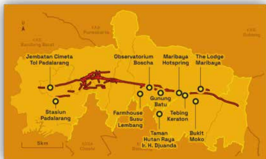
Figure 1. Distribution of activities throughout Lembang Fault

Various written sources describe that the Lembang Fault is a geological phenomenon located in the north of the Bandung Basin, stretching from the eastern part of Mount Manglayang to the western region of Parongpong-Cisarua through Lembang District, along 29 km with a movement speed of 6 mm per year (Fahrurijal, Tohari, & Muttaqien, 2020; Margaretha & Tirtawidjaja, 2012; Rachman, Winantris, Muljana, & Sulaksana, 2020; Widodo, Hepta, & Fairuz, 2017). Several buildings located above the area affected by the shift of the Lembang Fault include Dago Pakar Village, Tahura Juanda tourist area,