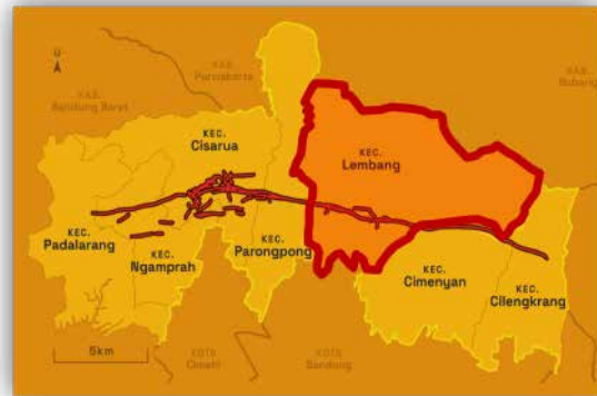
Figure 2. Affected Lembang District Area Of Lembang Fault Shift