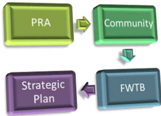
Figure 4. Research Method

mapping potential, and problems, as well as developing strategic issues related to the preparedness condition of Cikole Village and the Cikole Village Disaster Resilient Women's Forum in dealing with disasters. As for the preparation of the draft strategic plan using the desk study method.