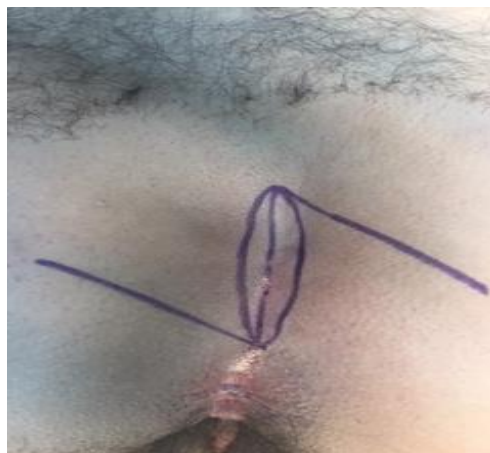
Figure 2 : Z plasty Incision

This research was a two-year study conducted between June 2016 and April 2018. The population consisted of 24 patients (15 males and nine females, median age 16 (14-17 years)) with pilonidal sinus disease. An approval no. 2019-91 dated 26.09.2019 obtained from the SBÜ Kocaeli Derince Training and Research Hospital Ethics Committee for this retrospective study. The patients were accepted one day before the operation, and laboratory tests take. They bathed the night before surgery, and the surgical area shaved carefully. On the morning of surgery, patients were transferred to the operating room and given spinal anesthesia. The anesthetized patient placed on two rolls (one under the chest and the other under the pelvis) in a prone position. The patient's head placed on a 45° lateral angle roll. The operation area was draped and prepared with Betadine (Figure 2).