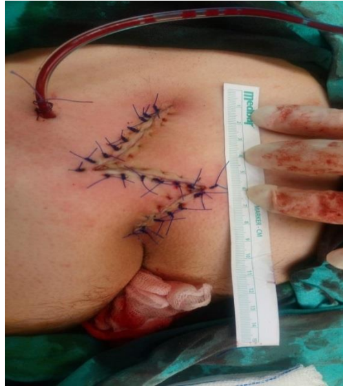
Figure 3: Z plasty Incision Line After an Operation

the sacrum. If there was any deep granulation tissue area, it excised after removing the sinus canal. The length of the primary wound was 2-6 cm. The limbs of Z cut to form an angle of 60° with the long axis of the injury. The length of each leg was equal to the length of the primary wound. The wings then transferred without stretching (Figure 3).