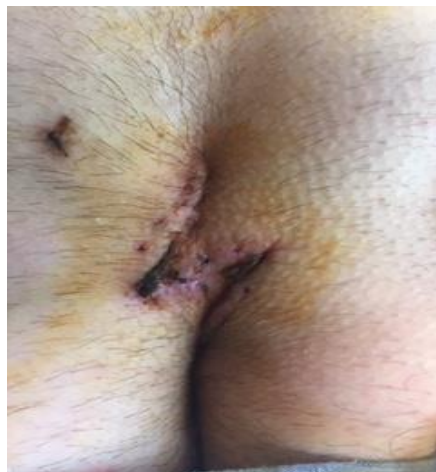
Figure 4: Cosmetic Result After The Operation

three abscesses and two hematomas. There were only two relapses (1.6%) at 1 to 9 years follow-up.