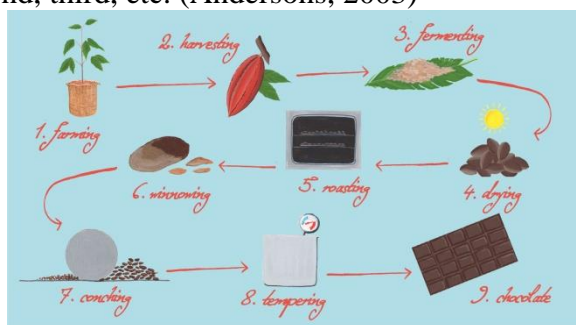
Figure 1 Sequence Picture of Making Chocolate

The writing were analyzed based on the language features used in the text such as using simple present tense correctly, using command or imperative sentence appropriately, using adverbial phrases properly such as adverb of time, manner, and place and using adverbs of sequence accurately such first, second, third, etc. (Andersons, 2003)