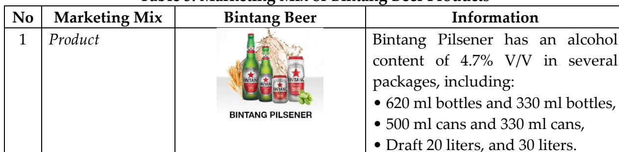
Table 3. Marketing Mix of Bintang Beer Products

After knowing the company's strategy, the next step is tactics. At this tactical stage, using the marketing mix, to support the strategy that has been developed, is shown in the table below.