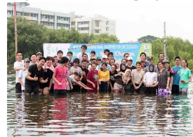
Figure 4. Planting Mangrove in Pesisir Marunda