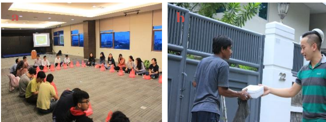
Figure 3. RECTAR activity a) The students breakfasting together with orphan from Babutaubah Mosque b) distributing the food to less fortunate people around Pulomas area.

One of the example of yearly regular Student-Led CSR is Ramadhan Event of Charity and Iftar (RECTAR) (Figure 2). It is a cross-religious charity program that conducted during Ramadhan Month initiated by i3L Muslim Community (Arabesque). Arabesque together with i3L Christian Community (iCC) managed the activity by organized fund raising and distributed foods for less fortunate people surround Pulomas area. In the development of the program, other religious community in i3L such as Buddhist Community co-hosted the event as well.