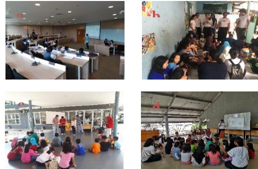
Figure 1. Student-Led activities in different location a) English Tutoring Program with YPU in i3L class. b) Science Tutoring Program with HORE in Kampung Guji. c) English Tutoring Program with YPU. The single time occasion is the program that conducted once with no reiteration afterwards. The example of single time occasion program was done