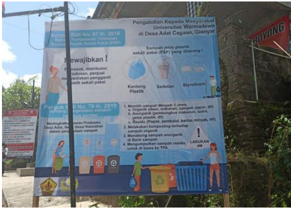
Figure 2. Socialization of regulations through posters and billboards

The posters have been distributed to 150 house groups including 300 heads of households (Figure 2). By knowing and understanding the mandate contained in the two regulations, public awareness to participate in reducing the use of SUP and managing from the source will increase.