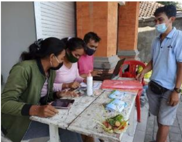
Figure 3. Waste Bank Activities with Applications

So far, partner villages have had a Waste Bank operated by Pemuda Potor who is part of the management of the Satya Pertiwi Garbage Bank (Figure 2). The operations carried out are still conventional, namely by manual weighing and recording. Manual weighing and recording also mean that the time needed to operate a waste bank is longer, even though this waste bank is still done voluntarily by volunteers from young people.