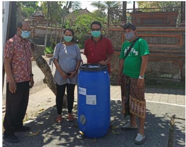
Figure 4. Composter Practice Demonstration

an instructional video on how to make compost in the household, it is hoped that the community can practice it directly in their respective homes (Figure 4).