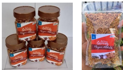
Figure 5. Red onion products in packaging