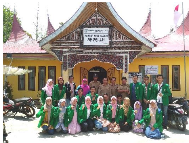
Figure 1. An official photo at the Wali Nagari Andaleh Office

Students who have been selected from various study programs and faculties at Andalas University are 25 people. Debriefing was carried out by the Andalas University Team and the Implementation Team. Before students are dispatched or deployed to the field, a field survey is carried out in Nagari Andaleh. After the meeting with Wali Nagari and Nagari devices in the Wali Nagari office we took a picture together with the Nagari local government officials in front of Wali Nagari's office Figure 1.