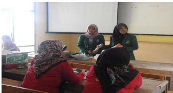
Figure 2. Extension of packaging demonstration Vegetables

The extension activities and demonstrations on the packaging of vegetable products were also held. With this vegetable packaging, it is hoped that farmer groups and the community can implement it so that it will increase the value of these vegetables. Good packaging will increase storage power and can be marketed in the surrounding mini markets. Extension of demonstration on packaging of vegetable products is presented in Figure 2.