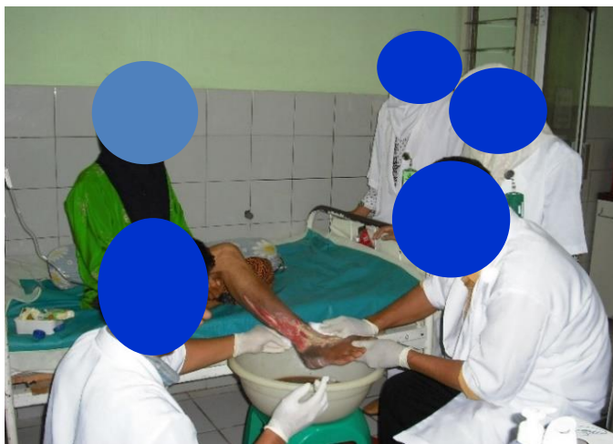
Figure 1. Treatment of diabetic foot wounds using a regular bed

Wound care in health care facilities that currently exist is not in accordance with the principles of safety and work comfort. The wound care bed is still an ordinary examination bed and has not been devoted to wound care with liquid medical waste, such as patent number US20070174965A1 [6]. To wash the wound, you must place a basin above the bed so that it is at risk of contaminating linen, the room and even the clothes of patients and nurses. The smell that arises from the wound has also not been managed properly, resulting in an unpleasant working atmosphere and an impact on the low quality of work.