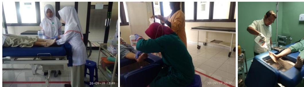
Figure 3. Photographic view in public test