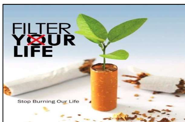
Figure 4. Cigarette Advertisement by Ateriet

The advertisement the theme of cigarette above carries two verbal signs. The first verbal sign is “Filter your life” which denotes literally removing something in our life through a filter. The term filter in the advertisement, is associated with the filter as in a cigarette. The filter in the cigarette is generally made of cellulose acetate obtained from processed wood used to filter tar and nicotine from cigarette, the most dangerous substances contained in cigarettes. Based on that explanation, the statement “filter your life” implicitly conveys a message to the readers to choose more carefully the things they are about to do in their life, especially those that can directly affect their body. It is by making sure it is the best for them and healthy for their body and avoiding the things that is negative and harmful. In association with the theme of the advertisement, one of the things that people need to avoid is smoking cigarettes because the habit can damage their health overtime.