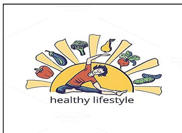
Figure 2. Healthy Lifestyle Advertisement by Freepik

cycle that affects the human body to prevent being seriously ill. A healthy lifestyle includes consuming healthy food or maintaining a nutritious diet, exercising regularly, and having enough rest or sleep. In the advertisement, the verbal sign implicitly motivates the readers to promote a healthy lifestyle in their everyday lives, minimizing the risk of being sick and improving their well-being. The most important thing to remember is that we can make a great difference by changing our lifestyle to healthier one because the lifestyle we adopt will determine our long-term health condition. Therefore, it is necessary to be mindful of small behavioral changes that can affect our lives in the future and make sure it is the best one.