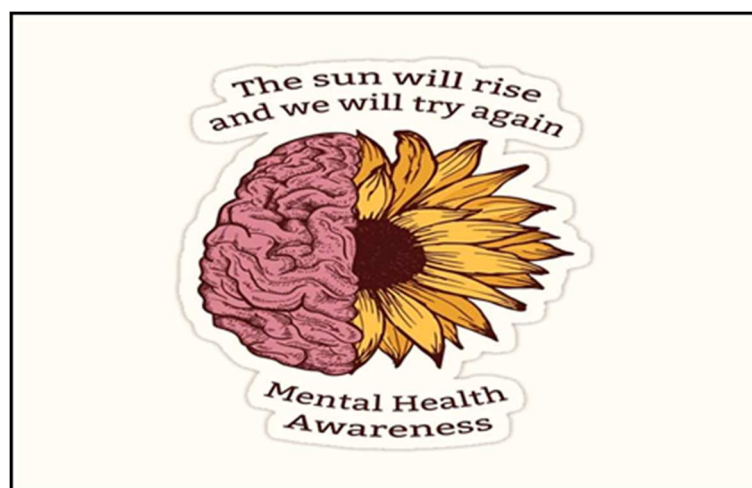
Figure 3. Mental Health Advertisement by Freepik

The advertisement above is related to the theme of mental health. Furthermore, there are three verbal signs can be found. The first verbal sign is "The sun will rise". The statement denotes the sun that will rise as the new day begins. "The sun" following the theme of the advertisement, represents hope. Therefore, the statement's implicit meaning is to encourage the readers that there is always hope for the people who think