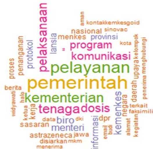
Figure 3. Wordcloud from the content with positive sentiment by the government accounts

Before conducting any statistical analysis, some data visualizations were carried out with wordclouds to find out what words or topics appearing frequently in the dataset. As can be seen in Figure 3, in the positive content within government posts the three most frequent words are "pemerintah" (government), "pelayanan" (services), and "kementerian" (ministry). Meanwhile in Figure 4, the words "pemerintah" (government), "penyakit" (disease), and "imunisasi" (immunization) are the three most common words in the content with negative sentiment posted by the government accounts.